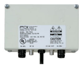
Individual External Power Supply, Starlight Gray PDI-750AS-G