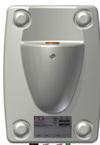
Slim Power Mount, Starlight Gray PDI-871-G

Ask about 10-tap central power supplies by PDi or Power over Ethernet (POE) TV option