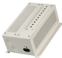
1 RF Input/10 RF ACTV Outputs PDI-772HE