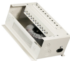
10 RF Inputs/10 RF ACTV Outputs PDI-772HE-IND

Ask about Individual Power Supplies by PDi or Power over Ethernet (POE) TV Option