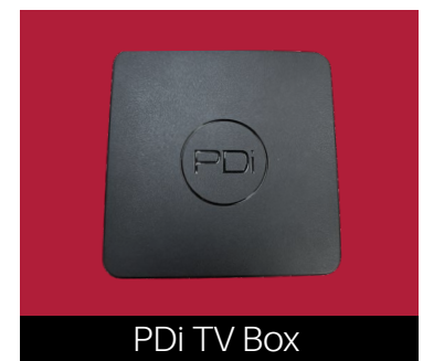
PDi TV Box