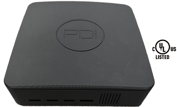
Model Number PDI-TV7000

Easily deliver Smart apps to the patient bedside, optimize staff efficiency, and improve your patient experience.