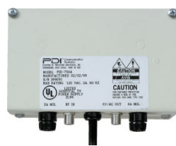
Individual External Power Supply, Starlight Gray PDI-750AS-G