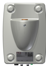
Slim Power Mount, Starlight Gray PDI-871-G

Ask about 10-tap central power supplies by PDi or Power over Ethernet (POE) TV option